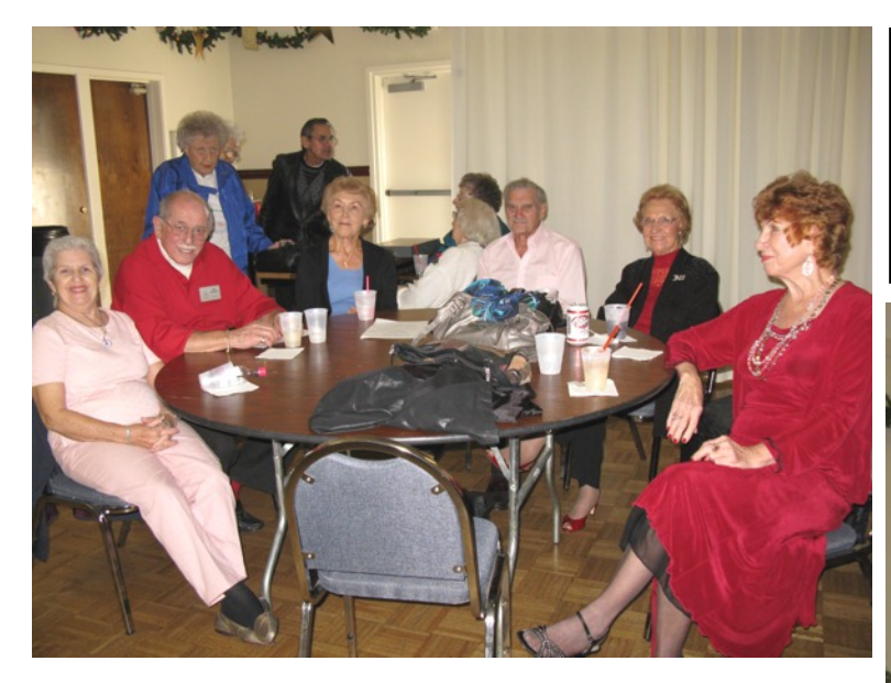
A TABLE FULL OF DIXIELAND JAZZ FANS