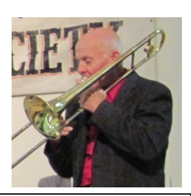
Live Dixieland in Stockton The first Sunday of the month, noon until 5:00 pm, Elks Lodge, 8900 Thornton Road