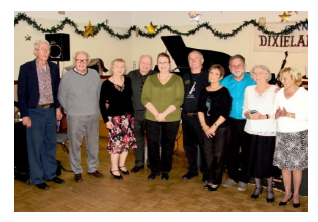
2013 SJDJS OFFICERS