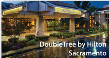
DoubleTree by Hilton Sacramento